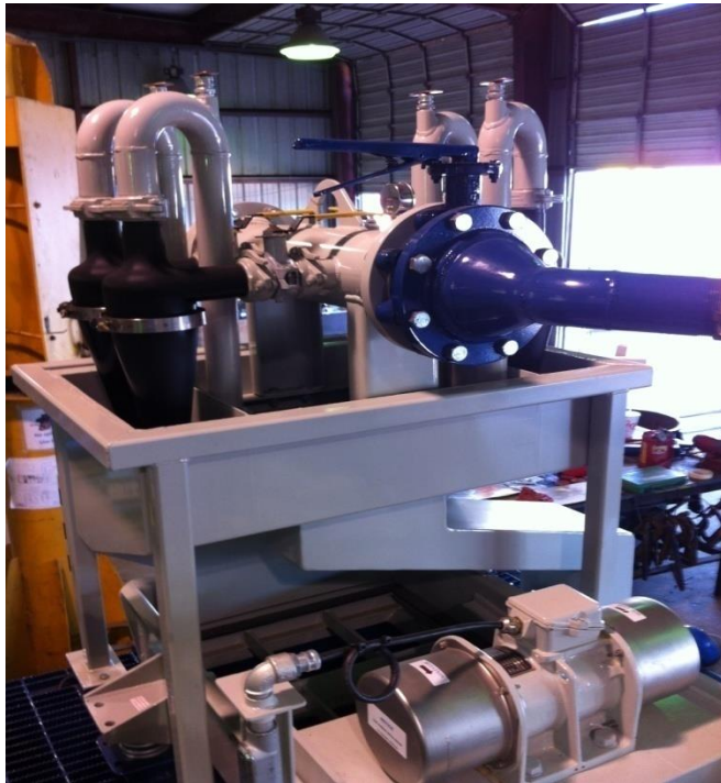
FIG. 21 Mud Cleaner 4-4"/126E Shaker